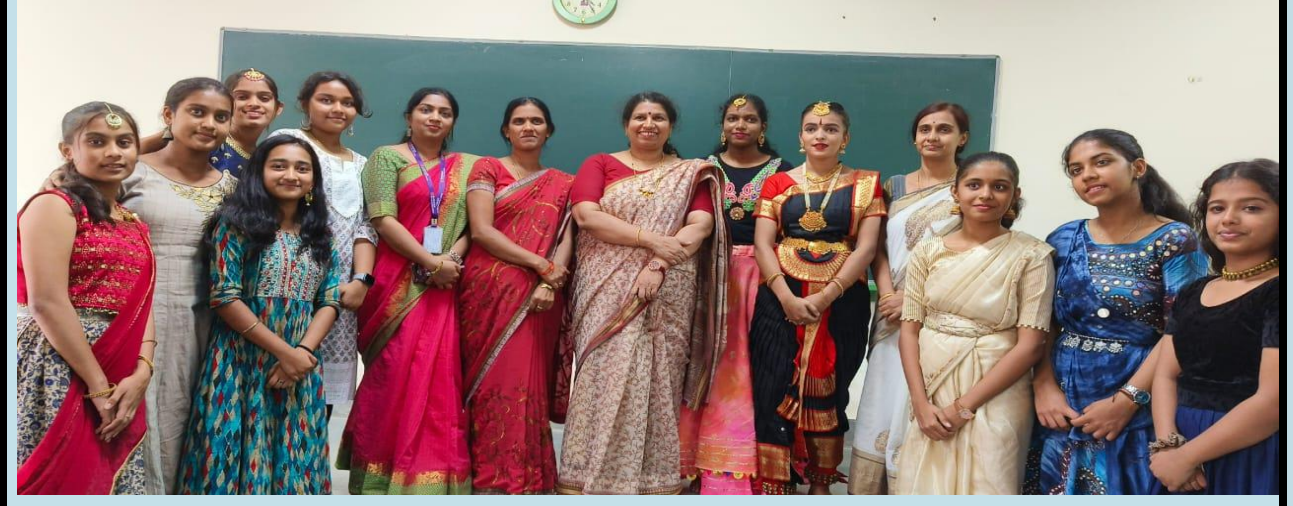
I PUC solo dance competitors posing with the Principal and cultural team

"Winning is something, But participation is everything"